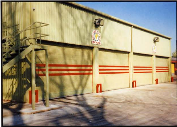
Steel Shutter, Plastisol finish extra cost