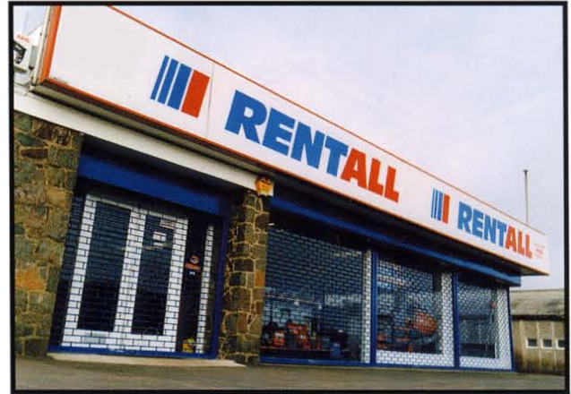
930 Grille, PPC extra cost